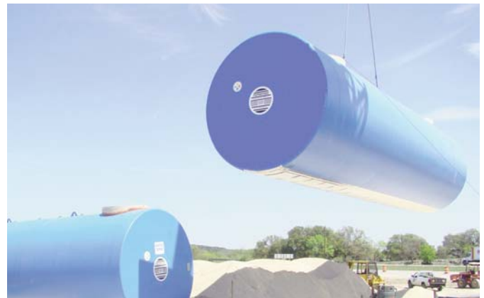
Compatible With a Wide Range of Fuels and Chemicals, Including Biodiesel and Ethanol

PROTECT THE ENVIRONMENT. BUY RECYCLABLE STEEL TANKS.