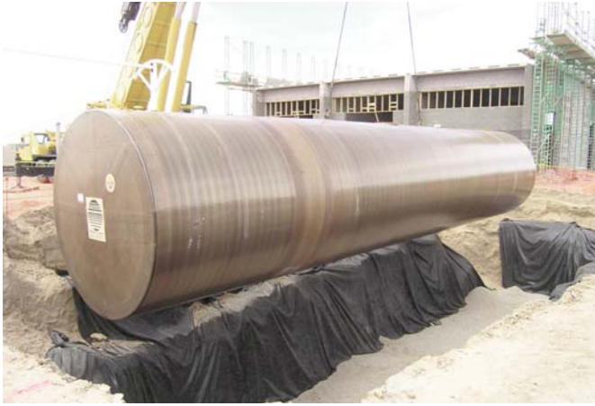
Meets EPA Leak Detection Requirements for Underground Storage Tanks

PERMATANK® double-wall jacketed underground storage tank features an inner steel tank coupled with an exterior corrosion-resistant fiberglass tank. A unique standoff material separating the inner and outer tanks creates a uniform interstitial space ensuring rapid and accurate leak detection.